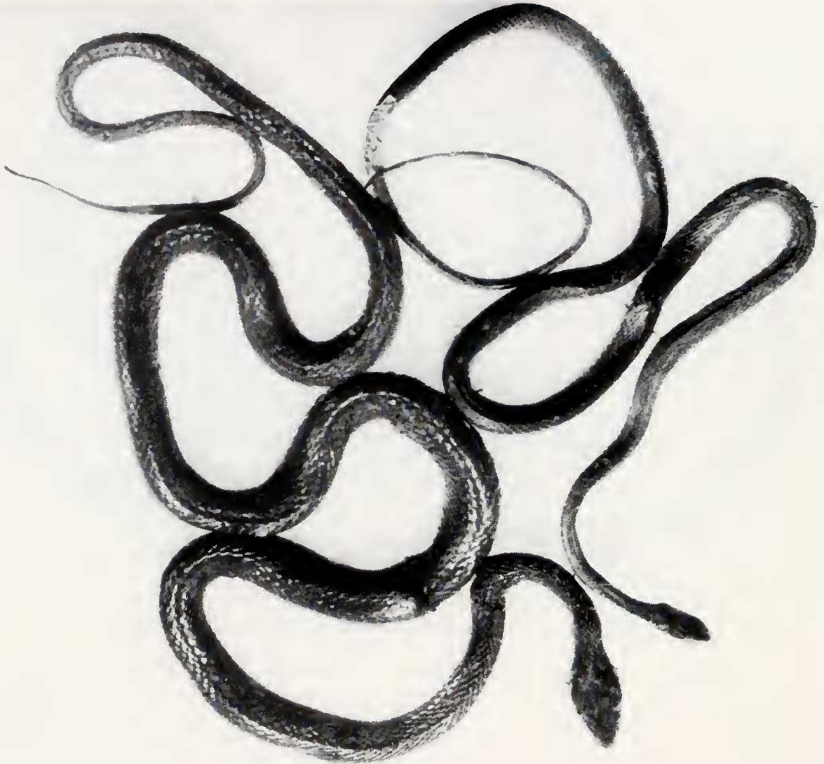
FIG. 2. Representatives of the "najadum-rubriceps"-complex. Left- Largest specimen of Coluber atayevi sp. nov. (Collection of the Caucasian Reserve no. 421). Right- Medium-sized specimen of Coluber najadum (Sochi environs, Maly Akhun, Collection of the Caucasian Reserve no. 94).

approximately 1/4 of total length, also characteristic of C. rubriceps .